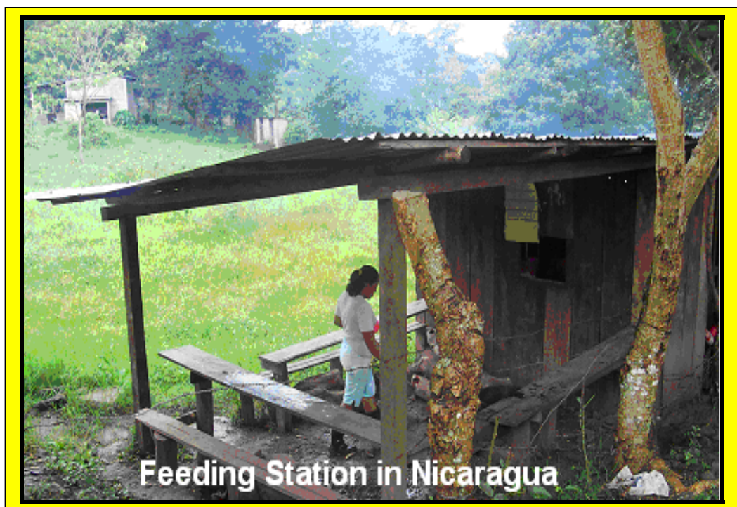
Feeding Station in Nicaragua